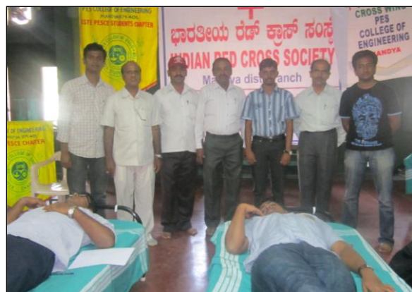
Blood Donation Camp on 29 October 2013