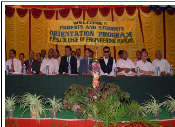
Orientation Day & Endowment Medal Awards, 13-9-11

ISTE Students Chapter of the PES College of Engineering, was instituted in the year 1999. Almost all the students are members of the institution for their entire course period. The total strength of 3000 include BE, M.Tech, MCA & MBA students who are in the campus. The members are benefited through attending technical, cultural, personality development