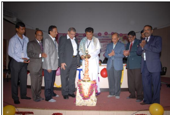
Technosugar 2012- X State Karnataka ISTE Student Convention - 09.11.12