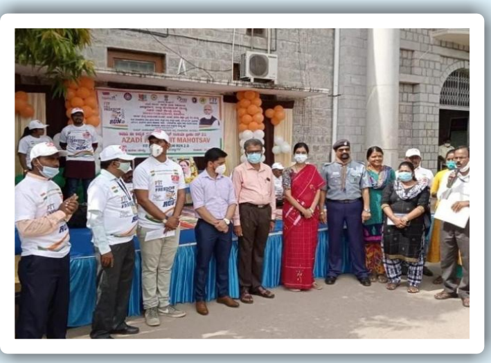
A Moment of FIT INDIA MOVEMENT 2021