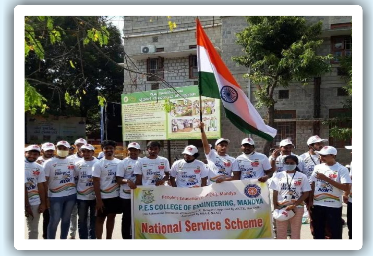
Positioning to Advance For FIT INDIA - 2021